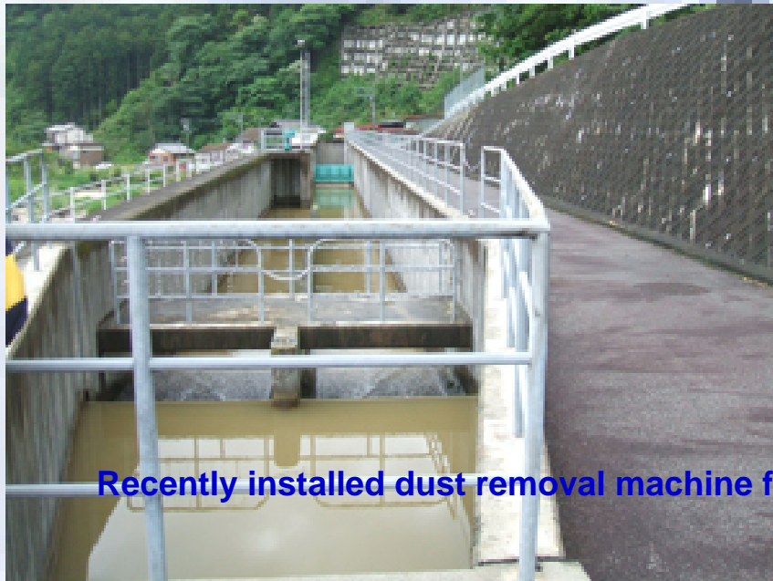
Recently installed dust removal machine facility