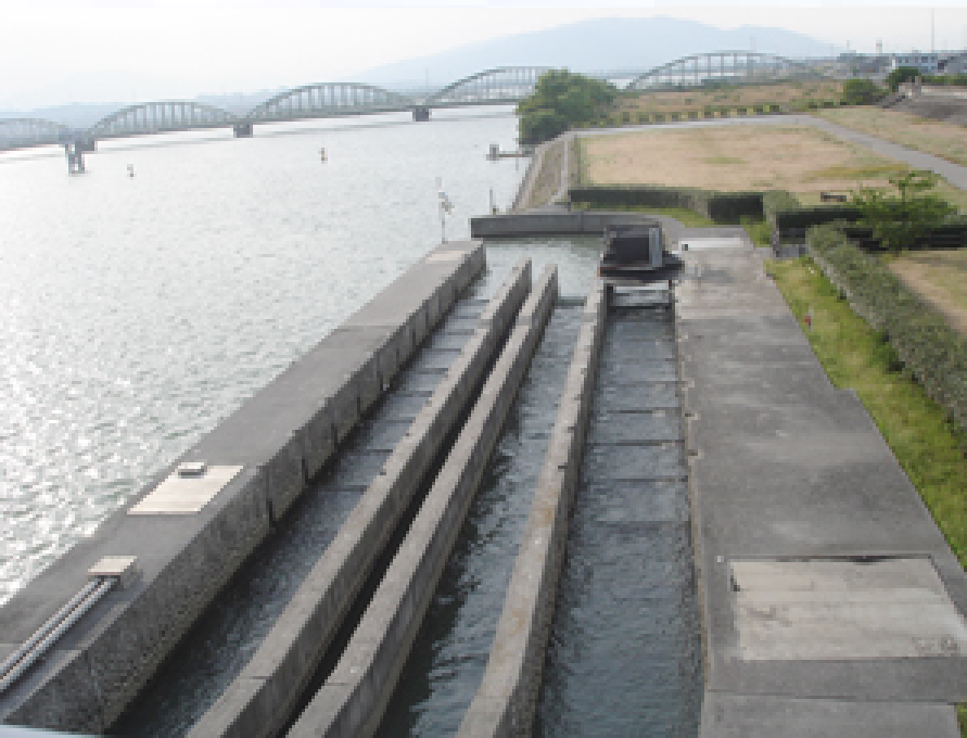
Fish ways of Nagaragawa Barrage