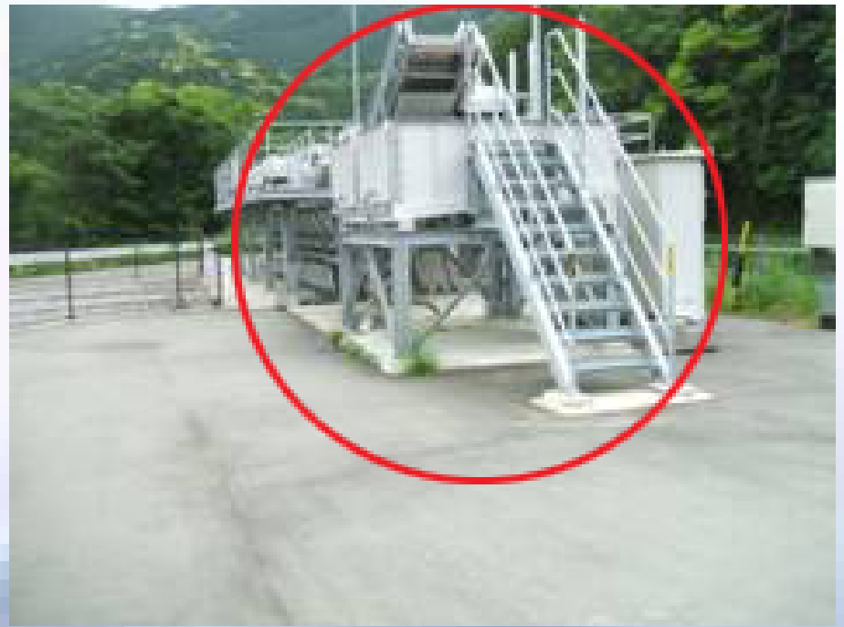
Recently installed dust removal machine facility